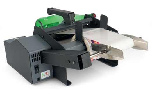
DTM AP380e features a liner rewinder (for an organised production line)