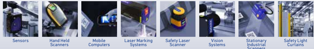
Sensors Hand Held Scanners Mobile Computers Laser Marking Systems Safety Laser Scanner Vision Systems Stationary Industrial Scanners Safety Light Curtains